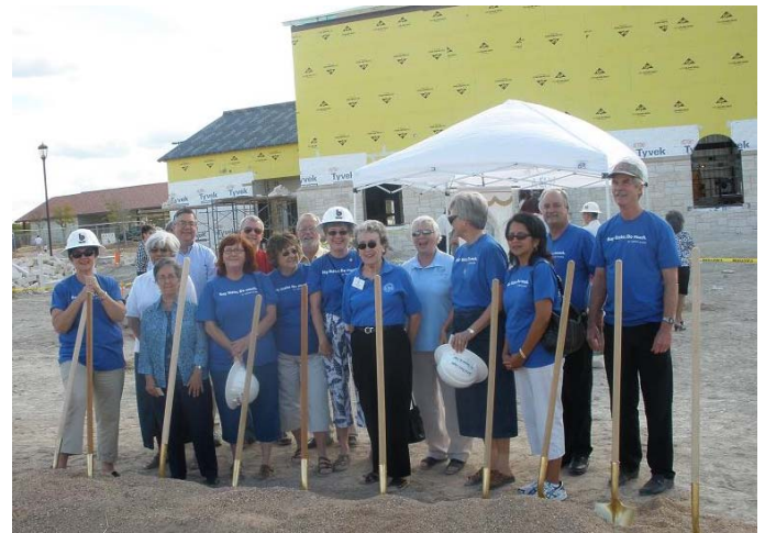
St. William's Vincentians gather to celebrate the beginning of their new SVDP building.

The tremendous growth of St. William Parish has resulted in the building of a new church, which opened in 2006. The second phase of the building program resulted in a Religious Education building; a Parish Center which includes an administration office and parish hall; Sacred Heart Chapel and the St. Vincent de Paul office and food pantry. Expected completion of these buildings is March of 2009.