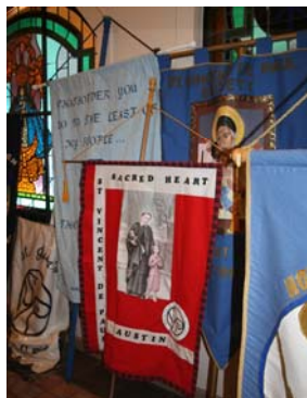
A collection of SVDP conferences' banners.

The Society of St. Vincent de Paul, along with the Ladies of Charity and Daughters of Charity, celebrated St. Vincent de Paul's feast day at Santa Cruz Catholic Church in Buda on Saturday, October 11 th . Over 200 members of the Vincentian family from around the diocese attended the celebration.