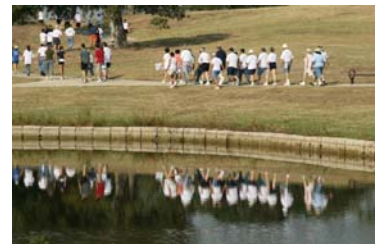
Walkers enjoy the scenic paths of East Metro Park in Manor.

The words of wisdom were quotes from Vincent de Paul like, “Say little. Do much.” Quotes from St. Louis de Marillac included, “Let us serve with hearts filled with the pure love of God which enables us always to love the roses amidst the thorns.”