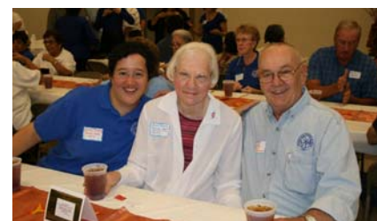
Vincentians from Sacred Heart – Austin enjoy the Feast Day banquet.

We offer a special thanks to the women and men of our SVDP conference at Santa Cruz for their gifts of time and talent setting up and decorating the PAC. May God bless you, as always our prayers are with you.